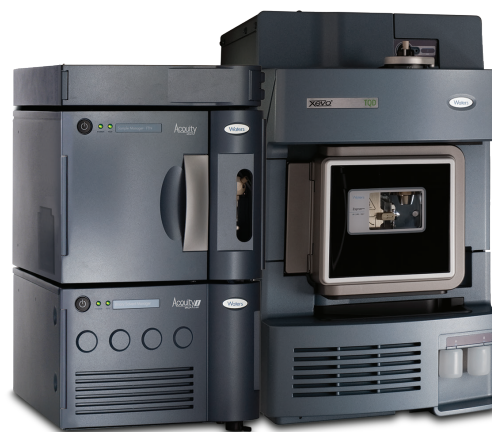
ACQUITY UPLC I-Class/Xevo TQD IVD System.